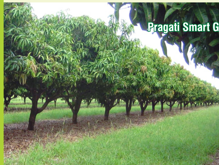
Pragati Smart Green Garden City