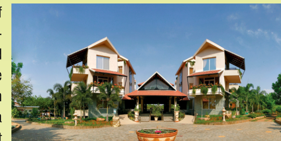
The nature's paradise

Pragati Group specialises in bringing you smart garden colonies to give relief from the ever growing urban adulterated and polluted living to provide a bio-diverse, pure living environment. Pragati has been recognised by United Nations and the global community for successfully maintaining the balance of nature to sustain the ecology at its Pragati Bio diversity Knowledge Park in Hyderabad. The park spread over 2500 acres has been transformed into a lush green, bio-diverse, self sustainable living space with 33 lac herbal, fruit and wood bearing trees based on the practices of Indian scientific traditions and sacred methodologies. The arrangement of 800 varieties of sacred herbal and heritage medicinal plantations at various pockets here called Aushadhies are Pranapradatas and Arogyapradatas. They remove toxins from the body, refresh an individual through aroma therapy and have made the area completely free from mosquitoes, bad bacteria and viruses. The flora support system has been augmented with water bodies and an innovative water supply system to reduce the temperature here 6-7 C° lesser than city levels. The zero pollution, carbon free environment here can further be substantiated by the prevailing ambient air quality standard of only 1.4 in Pragati as against the permissible limit of 100.